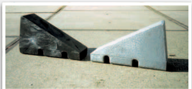
Standard (left) and Heat Resistant (right) KLP® Rollblock